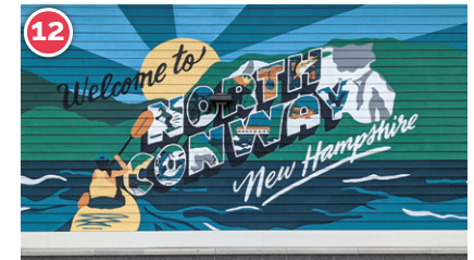
Welcome to North Conway Pandr Design Co | Medium: Painted Mural

Using house paint and canvas, the murals depict two semi-abstract faces in an enchanting moment of communication right before a kiss.