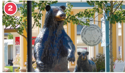
The Bronze Bears Fiberglass Farm | Medium: Fiberglass Sculpture