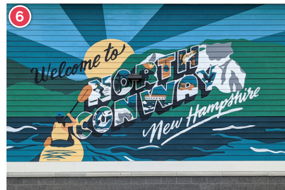
Welcome to North Conway

Snap a pic in front of this giant wings mural next to Banana Republic and post on Instagram using #seenatsettlers.