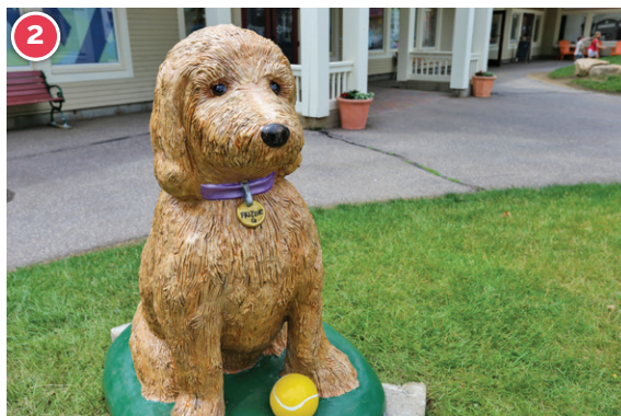
Frizzie The Dog

Meet Saco and Tuck! They are the perfect photo op with friends and family. Our beloved bronze bears came to us in 2015.