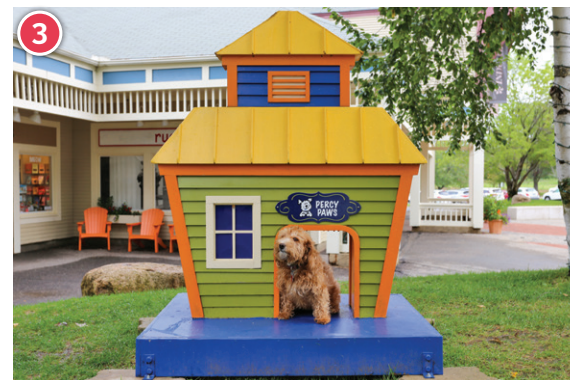
Percy's Dog House

Frizzie G. sits nearby Percy Paws and Percy's Dog House. Frizzie The Dog joins The Bears (Saco and Tuck) and The Red Fox (Copper).