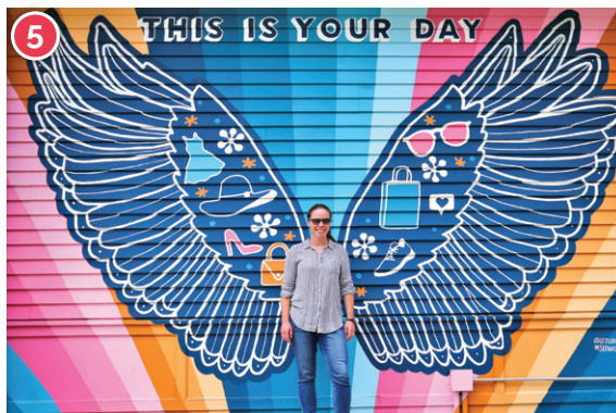
This Is Your Day Wings

The Settlers Green logo mural wall is meant to inspire a quick photo with a friend while on your shopping trip. #seenatsettlers.