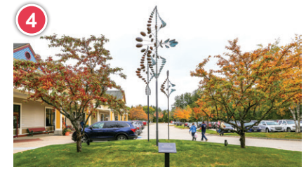
Twisters Lyman Whitaker | Medium: Copper, steel & stainless steel.

Carved from a six-foot-high block of marble like the Greek columns called "Caryatids," the sculpture is intended to stand watch over the marketplace.