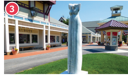
Caryatid Melanie Zibit | Medium: Marble Sculpture

Meet Saco and Tuck! They are the perfect photo op with friends and family. Our beloved bronze bears came to us in 2015.