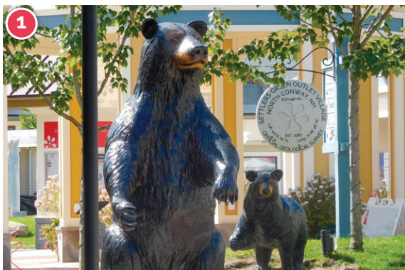
The Bronze Bears

Fiberglass Farm | Medium: Fiberglass Sculpture