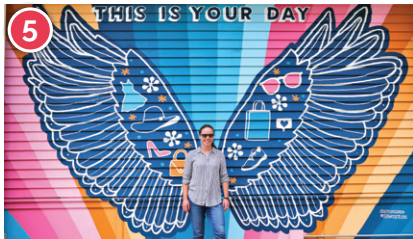
This Is Your Day Wings Pandr Design Co | Medium: Painted Mural