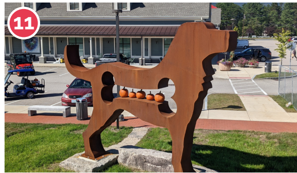
11 American Dog Dale Rogers | Medium: Cor-Ten Steel, Sculpture

Using house paint and canvas, the murals depict two semi-abstract faces in an enchanting moment of communication right before a kiss.