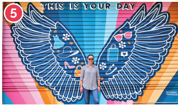
This Is Your Day Wings Pandr Design Co | Medium: Painted Mural