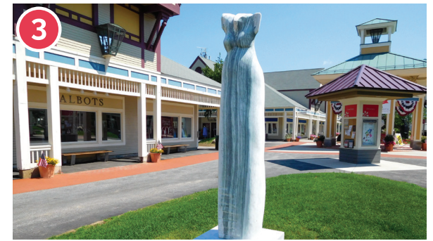
Caryatid Melanie Zibit | Medium: Marble Sculpture

Meet Saco and Tuck! They are the perfect photo op with friends and family. Our beloved bronze bears came to us in 2015.