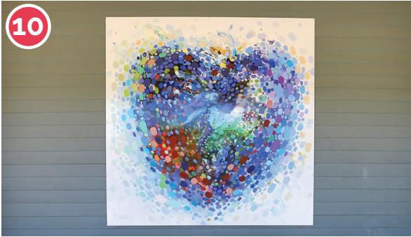
10 Heart of the Cosmic Kristen Pobatschnig | Medium: Painted Mural

Created to uplift and inspire, and capture movement, light and the Natural World, it is inspired by elements of Nature and the Cosmic.