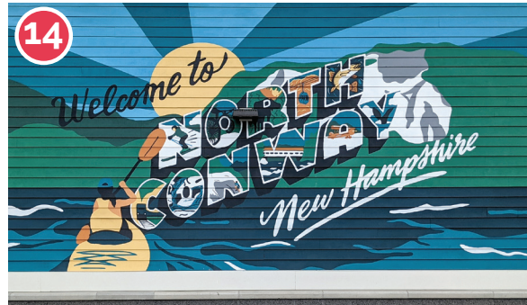
14 Welcome to North Conway Pandr Design Co | Medium: Painted Mural

Standing at 12 feet tall, the American Dog is artist Dale Rogers' most iconic sculpture. Many New Englanders will recognize it from a 26-foot tall version at Exit 48 on Route 495 in Massachusetts.