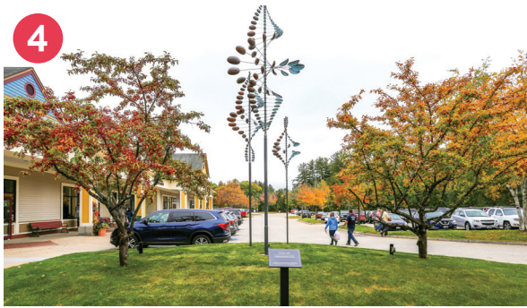
Twisters Lyman Whitaker | Medium: Copper, steel & stainless steel.

Carved from a six-foot-high block of marble like the Greek columns called "Caryatids," the sculpture is intended to stand watch over the marketplace.