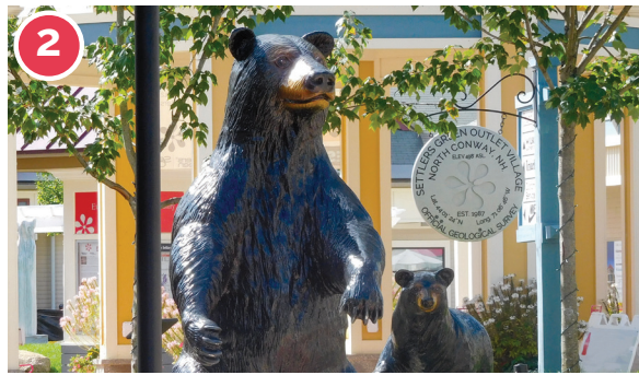
The Bronze Bears Fiberglass Farm | Medium: Fiberglass Sculpture